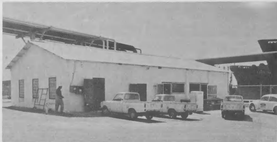
This is the Finger Pier Lunch Shelter which serves as a temporary "haven" for Mechanical field workers and dock personnel at lunch time.

activity during turnaround work or other projects.